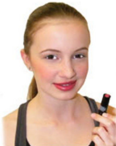
6. Traditionally red is used. For a clean contemporary design I have used a beautiful soft coral red.