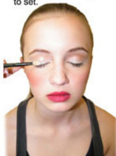
7. Pearl white eye color is applied on eye lids, as hilite under brows and under lower lashes to make eyeliner "pop" and be more effective.