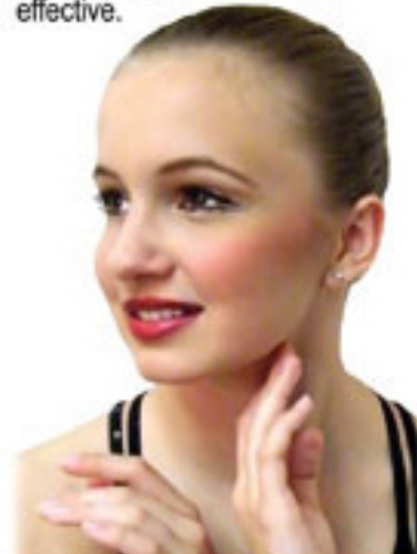
11. The finished "Clean Beauty" makeup application!