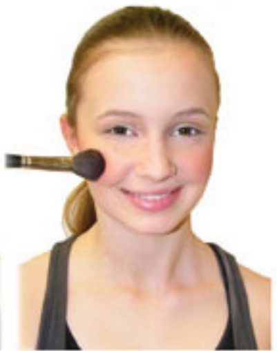
4. Apply cheek color over half of apple of cheek and follow up cheekbone to hair line. Remember stage lights will wash you out.