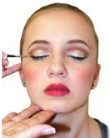
9. Apply black eyeliner to upper lid extending up and out. Let dry.