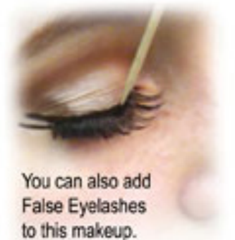
You can also add False Eyelashes to this makeup.