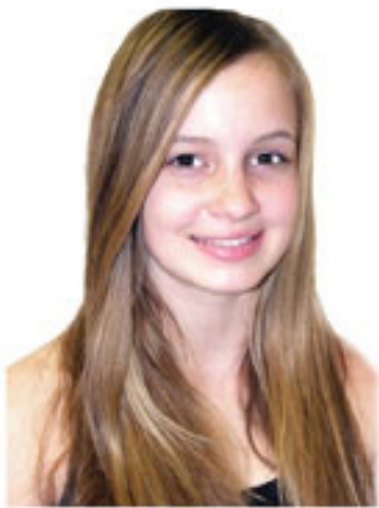
1. Start with a clean face. Pull your hair back to begin.