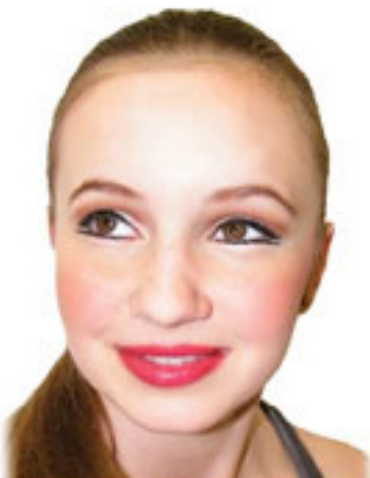
10. Apply eye liner to lower eye lid, keeping outer eye lines open. Apply mascara to lashes.